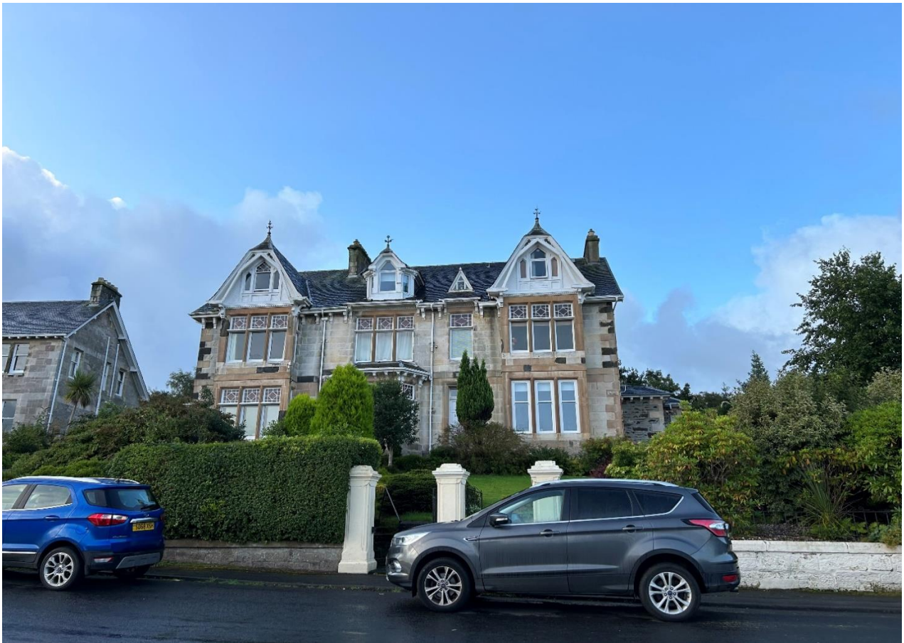
Front elevation of 19-21 Crichton Demonstration completely different fenestration and transom height in lower flat but approved REFERENCE NUMBER: 12/02280/PP