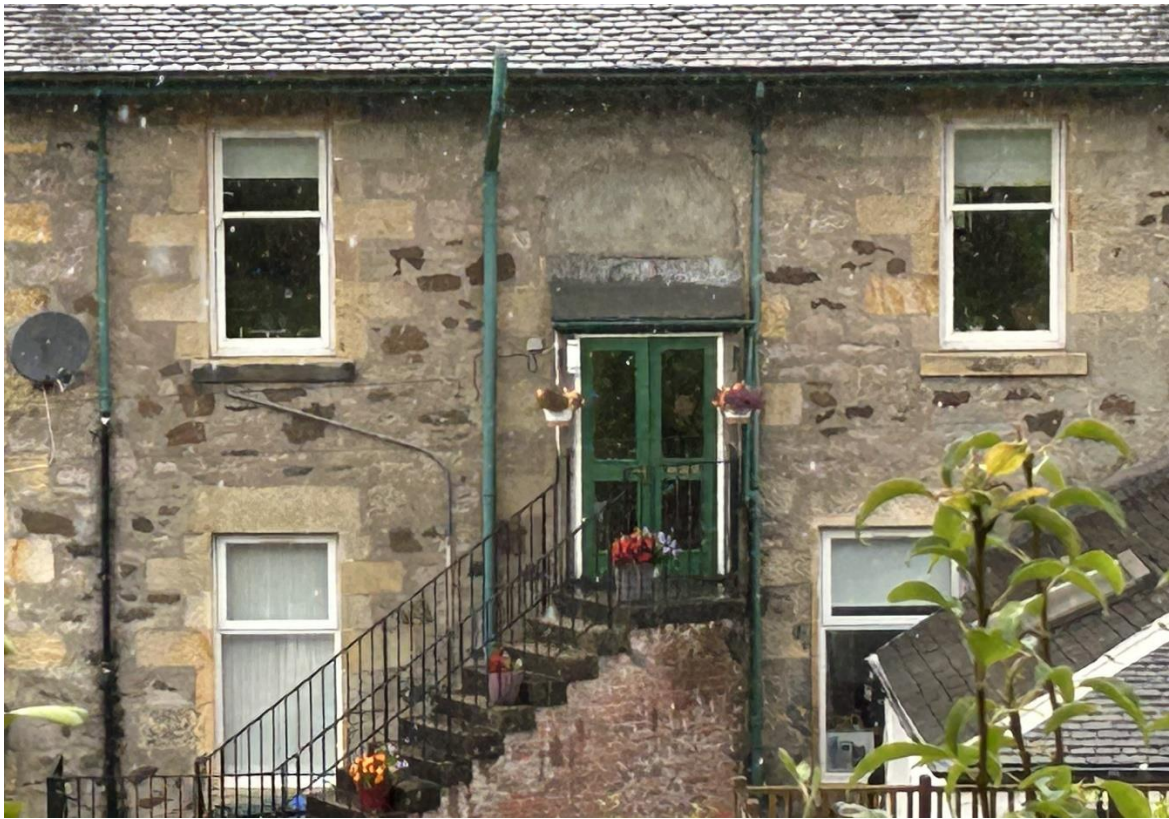
Rear elevation of 25 Crichton Road. Adjoining property, mixture of uPVC and Timber windows