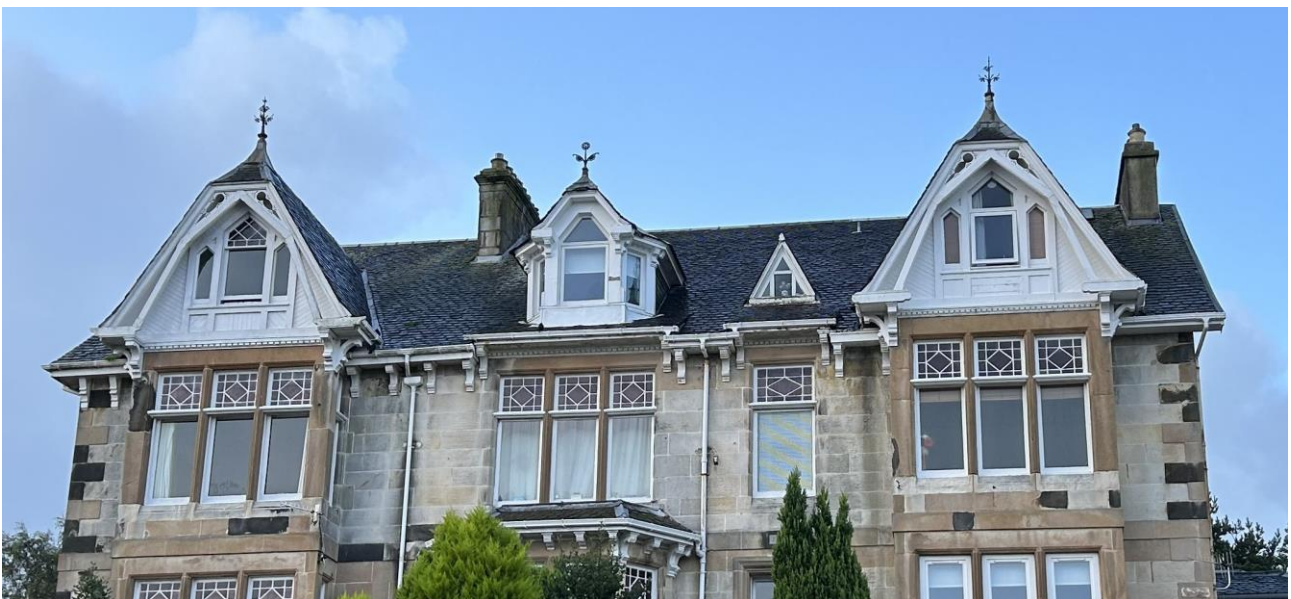
No inharmonious view from the street between opened sliding sash and double swing windows at the top of the properties.