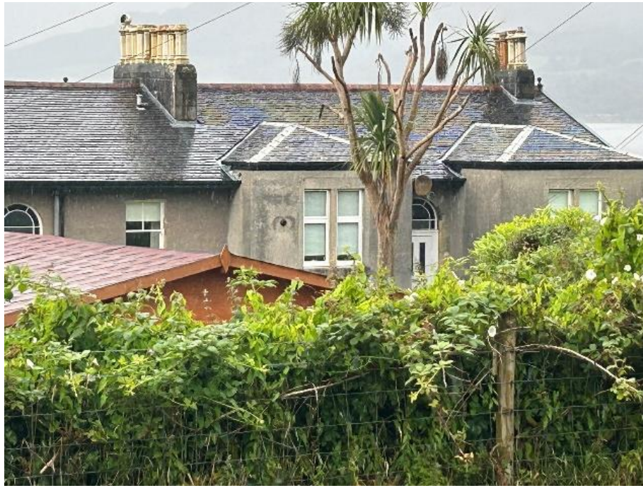
Rear elevation of 32 Crichton Road demonstrating a mixture of uPVC and timber windows.