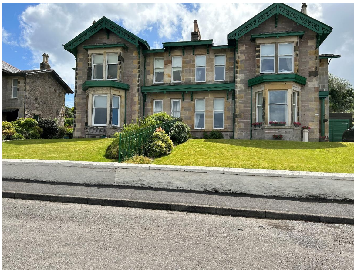
Front elevation of 28 -28 Crichton Road, demonstrates no difference in appearance of windows, lower flat 28, double swing, 27 Crichton Road sliding sash.