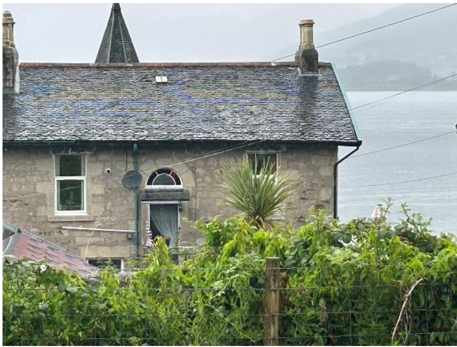
Rear elevation of 32 Crichton Road demonstrating a mixture of uPVC and timber windows