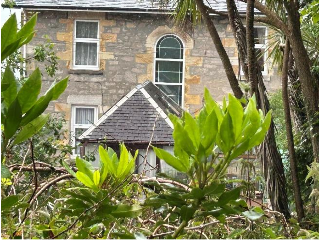
Rear elevation of 23 Crichton Road demonstrating uPVC replacement