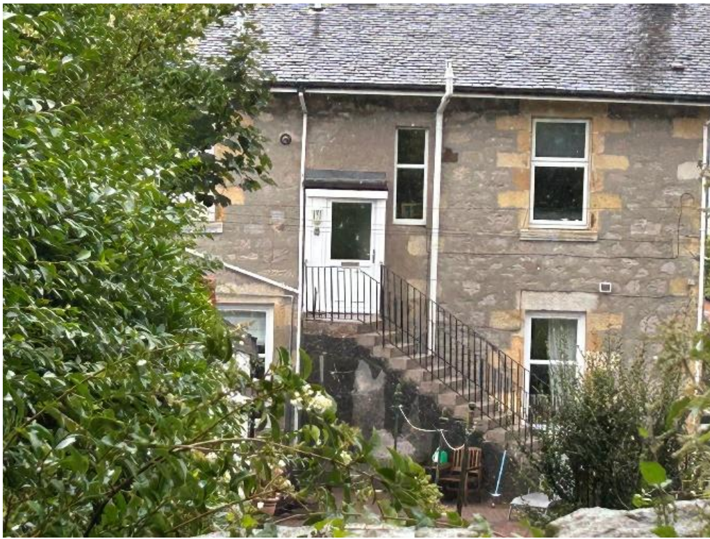
Rear elevation of 24 Crichton Road demonstrating uPVC replacement